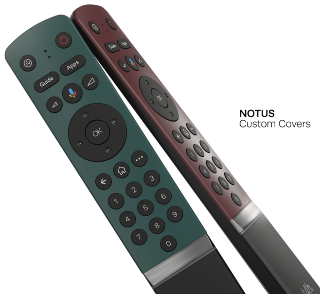
NOTUS Custom Covers