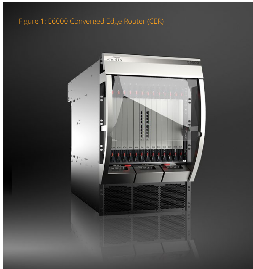
Figure 1: E6000 Converged Edge Router (CER)

Phase 2 recommends the use of high-capacity devices (i.e., CCAP), which can offer significant reductions in cost, space, and power consumption. This will enable service providers to save rack space and power while supporting converged services and faster speeds to more customers.